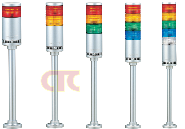
LME-102U LME-202U LME-302U LME-402U LME-502U

Size : 60 mm (2.57") Diameter. Comes with 3 meter (10 Foot) sleeved cable. Voltage : 24 VAC/VDC, LED Modules are interchangeable and stackable after purchase (Up to 5 LED Modules) CE Compliant and UL, C-UL Component recognized. IP-65 Rated and NEMA Rated 4, 4X and 13. Pre-wired and Pre-assembled for easy ordering and installation. NPN and PNP Open collector compatible. FB Types include two selectable, single-tone intermittent alarms with adjustable volume to 90 dB (at 1 m) and flashing function. Pole mount versions include 300 mm (11 3/4"). Aluminum pole and circular mounting bracket with mounting screws and flange nuts. Optional mounting brackets available.