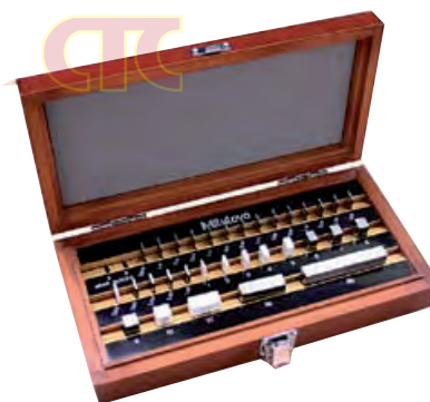
Steel Block Set

Precision gage blocks are the primary standards vital to dimensional quality control in the manufacture of parts.