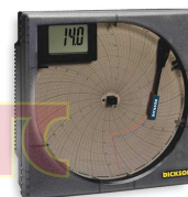
8" Chart, Universal input recorders