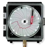
4" Chart, Pressure recorders